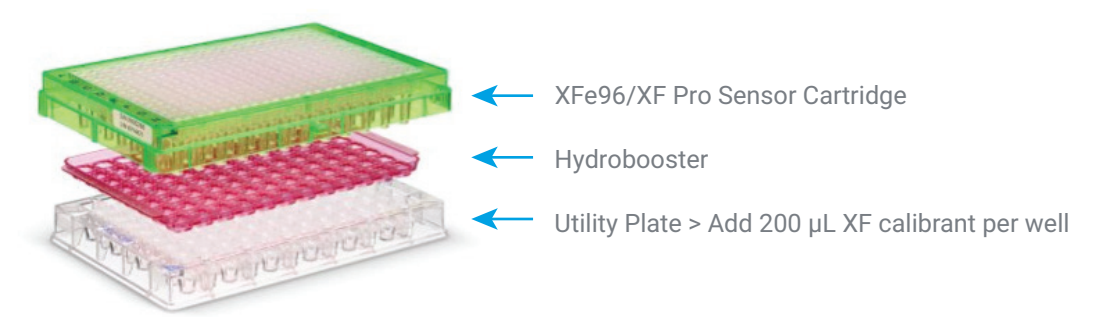
Figure 1. Assembly of the Agilent Seahorse XF Pro Hydrobooster with the Agilent Seahorse XFe96/XF Pro sensor cartridge and utility plate.